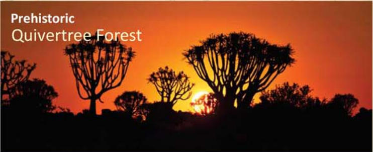
Prehistoric Quivertree Forest