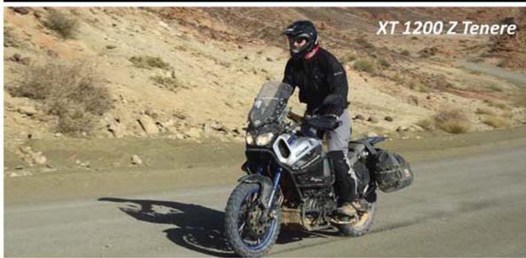
XT 1200 Z Tenere