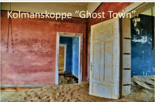
Kolmanskoppe "Ghost Town"

Namibia is a vast and desolate country, its beauty is virtually unmatched on the African Continent. Ride Namibia with us.