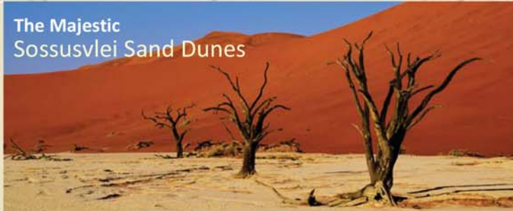
The Majestic Sossusvlei Sand Dunes

For detailed tour pricing and itinerary, please visit www.yamaha-adventure.com