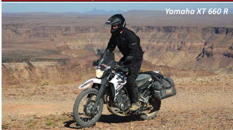
Yamaha XT 660 R