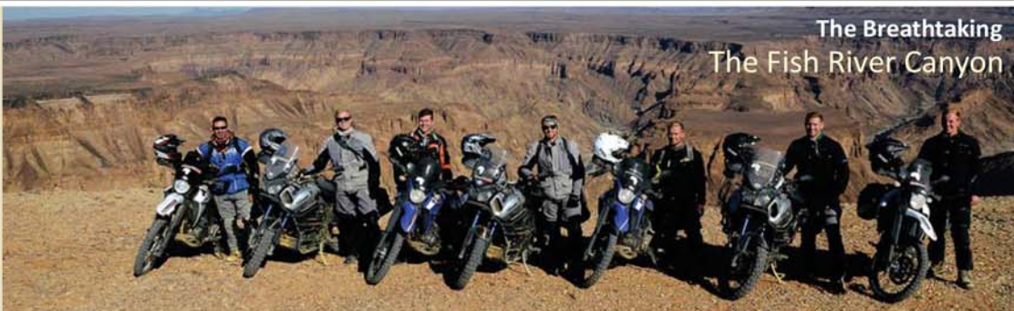
The Breathtaking The Fish River Canyon

Enquiries: +27 (0)741 90 99 77 Email: craig@yamaha-adventure.com